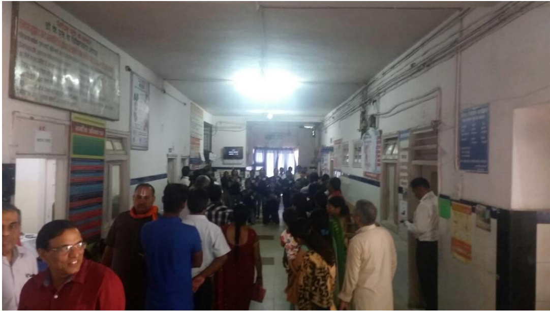
2) Anti-tobacco skit- In collaboration with IDA, Bhopal (31 st May 2017)